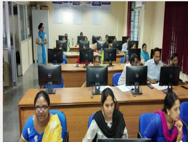
Five Day Workshop on Cisco Networking Academy's Internet of Things Fundamentals: Connecting Things 2.0