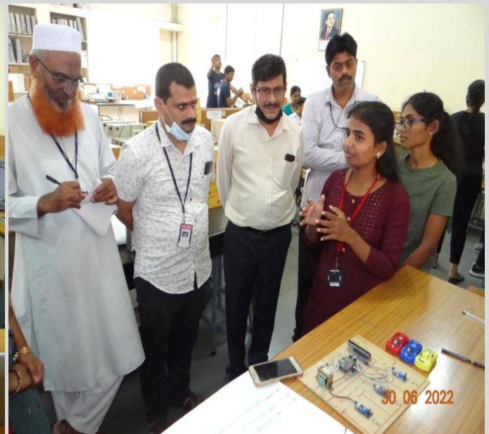
Students explaining their prototype to the Judges during “Project Expo on 30 th June 2022” as part of MICROCOSM-2K22 (Yearly department Fest)