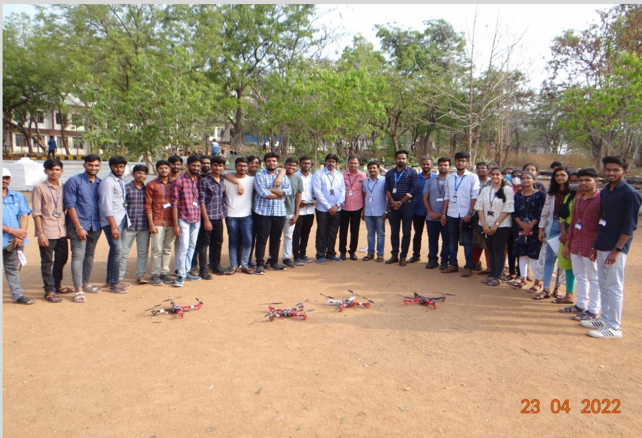
Department of ECE, MGIT has conducted a workshop on “Drone Designing and Manufacturing in association with IETE Student Forum-MGIT & Sky Rider” on 22 nd and 23 rd April 2022.