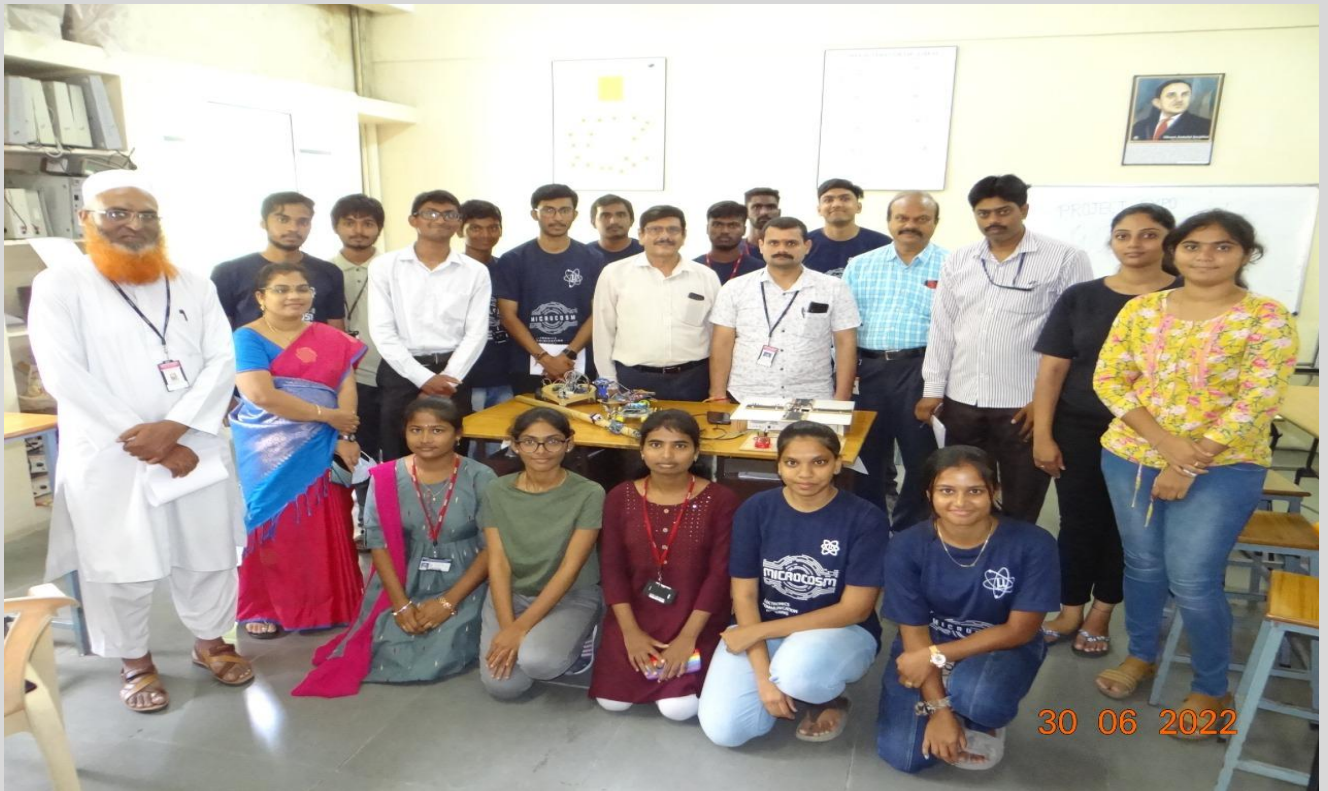
Department of ECE, MGIT has successfully conducted “Project Expo on 30 th June 2022” as part of MICROCOSM-2K22 (Yearly department Fest).